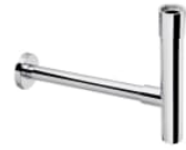
1 1/4" outlet connector for basin. 300 Pipe