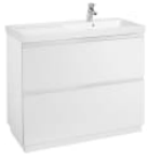
Unik (vanity unit and basin on the right)