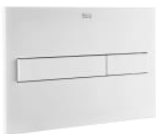
PL7 DUAL - Dual flush operating plate for concealed cistern