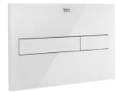
PL7 DUAL - Dual flush operating plate for concealed cistern