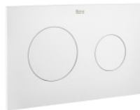
PL10 DUAL - Dual flush operating plate for concealed cistern with matt finishes