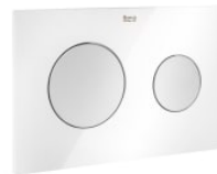
PL10 DUAL - Dual flush operating plate for concealed cistern