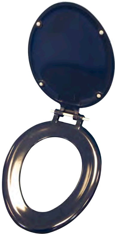
Shown: Ring seat STDBLRING