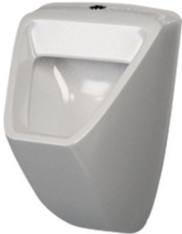
Shown: Square urinal with top inlet URGEOTOPHO