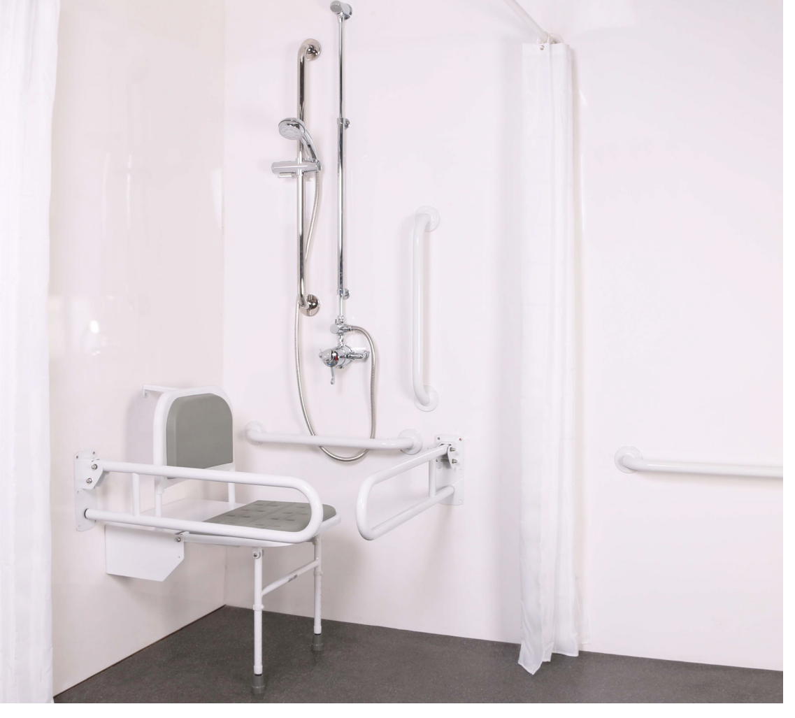
Shown for illustration: Exposed shower pack. {\sf SHWRPKEXPWH}