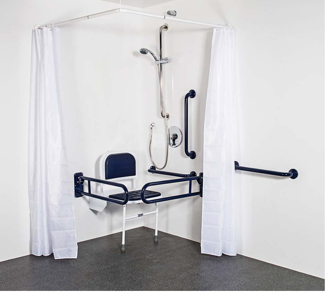
Shown for illustration: Concealed shower pack: SHWRPKCONBL