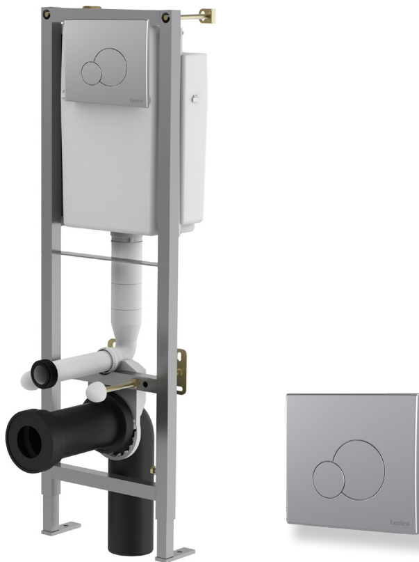
Push plate supplied