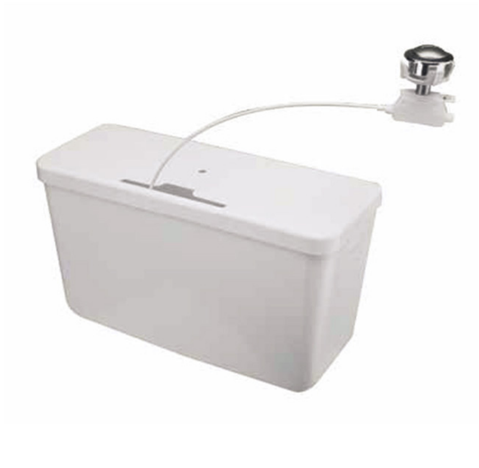
Shown: Concealed cistern with pneumatic push button BTWPBCI