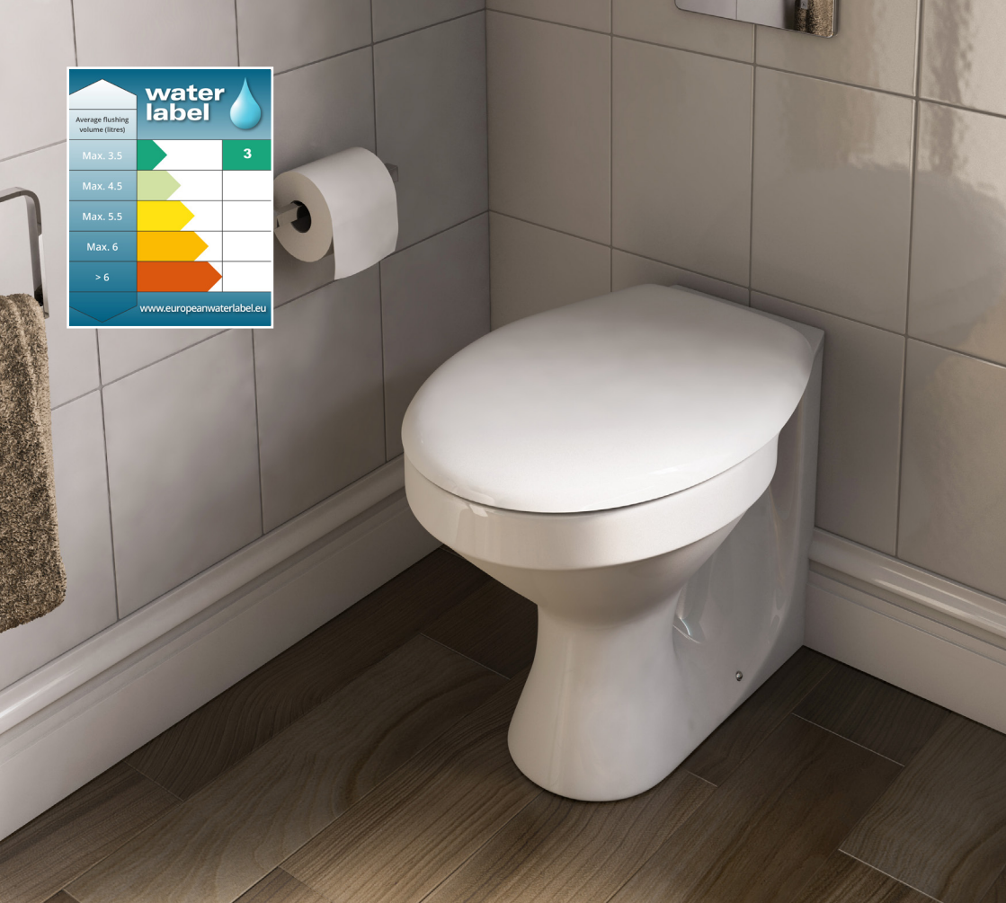
Shown: Back to wall pan, concealed cistern and soft close seat. GEOWHBWPA - BTWRIMCI - STWHSCUNP