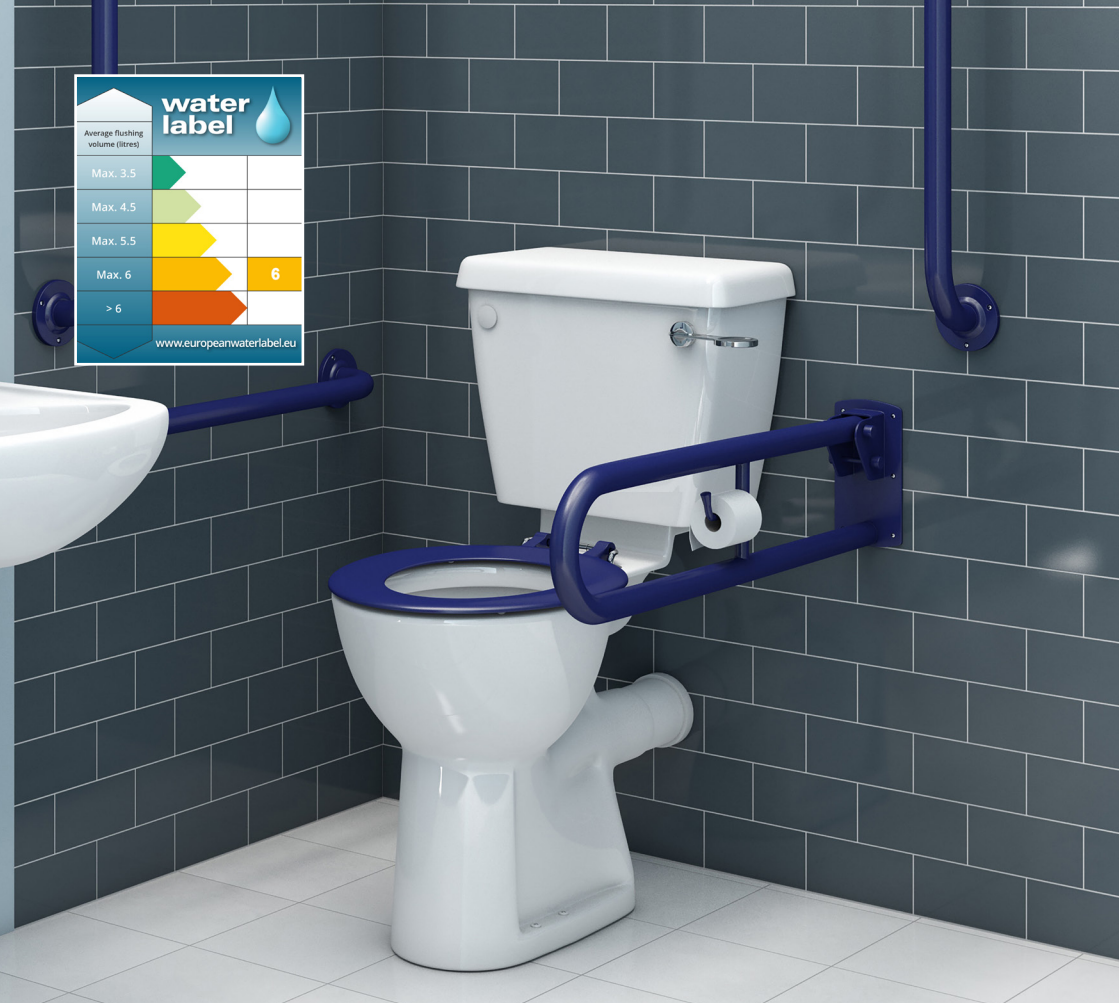
Shown: Comfort height Wc with ring seat. DOCMNPAN - DOCMCI - CPKDOC - STDBRING Rails shown for illustration