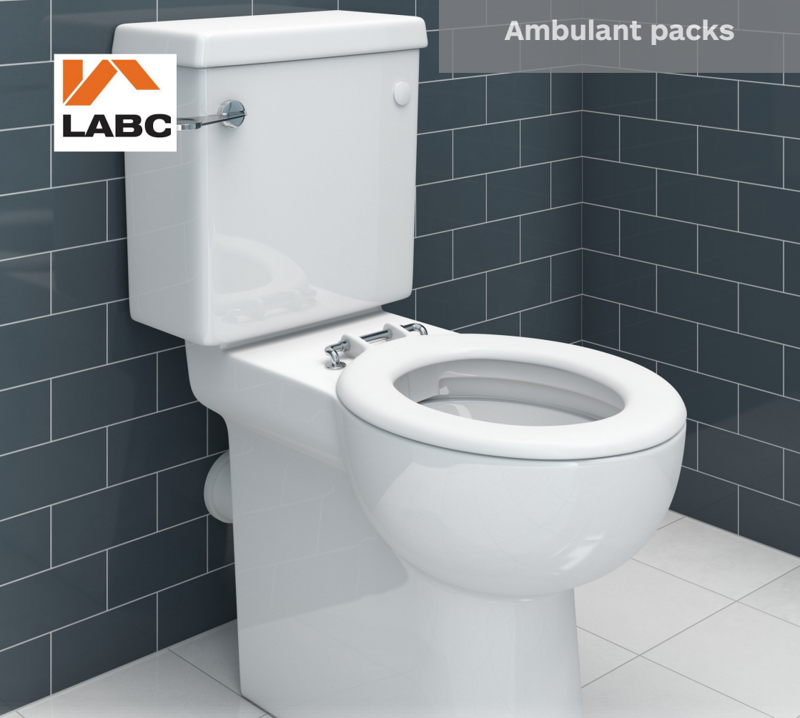
Shown: Rimless 750mm close coupled WC which is included in the ambulant pack