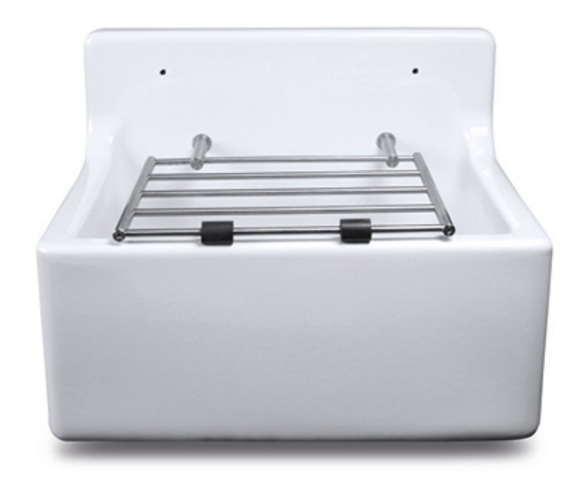
Shown: 18" low back cleaner sink. CLEANL18SET