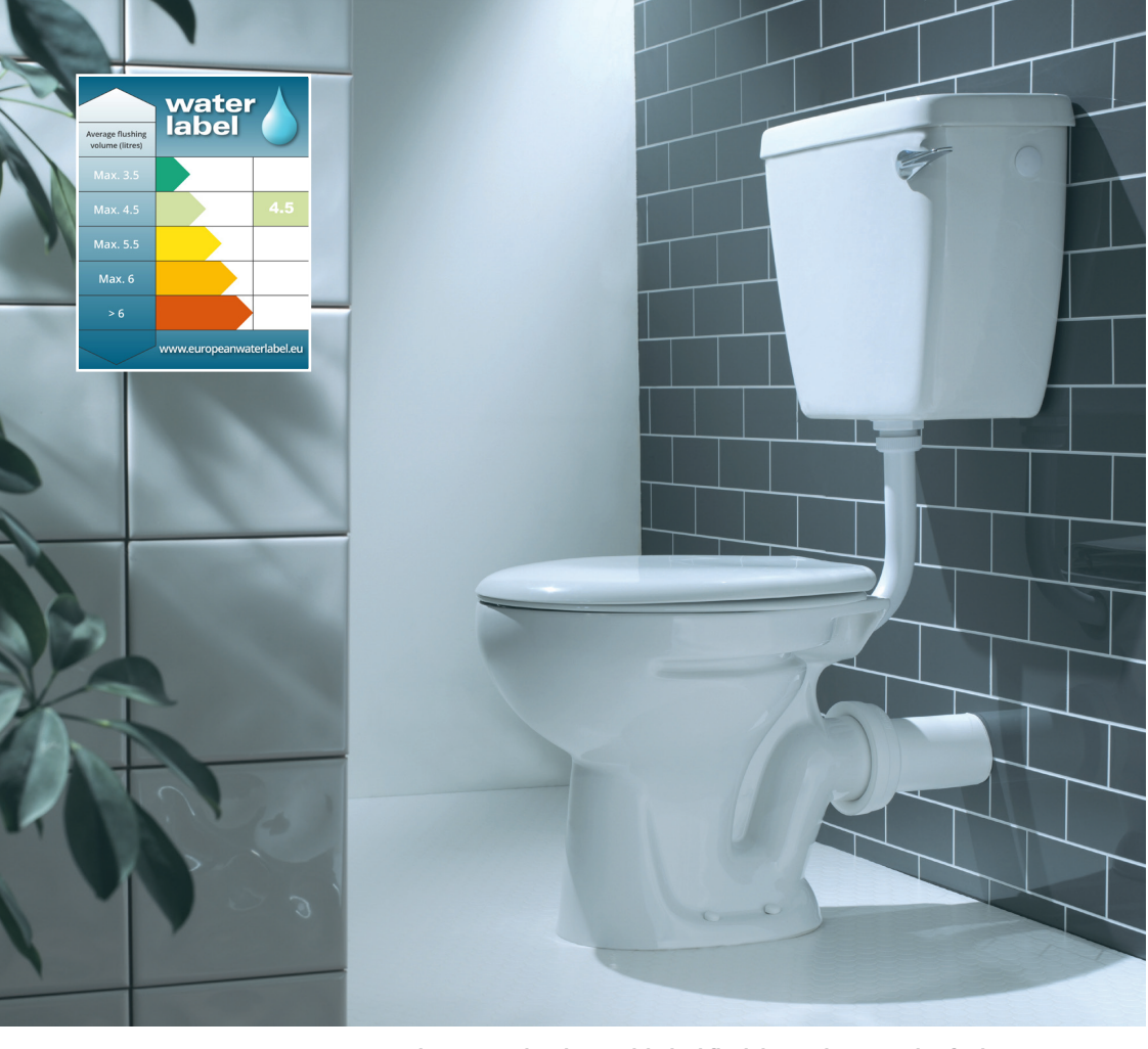
Shown: Low level WC with dual flush lever cistern and soft close seat ASWHLLPA - ASWHLLBCI - STWHSCUNP