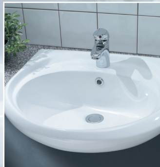
56cm Semi recessed basin ARWHBA1