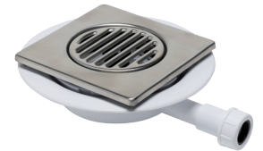
Tiled Floor Gully